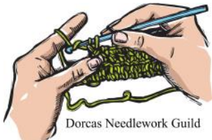
Dorcas Needlework Guild

Would you like to make a difference in the life of a girl who has been rescued from an unbelievable nightmare? The Dorcas Guild will begin making twin bed quilts to donate to Street Ransom , which is the Straight Street Ministry's outreach for victims of sex trafficking. Yes, this actually IS a serious